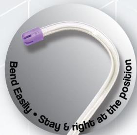
Bend Easily • Stay & right at the position