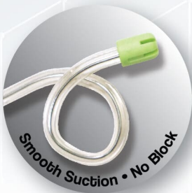
Smooth Suction • No Block

Our Saliva Ejector 145mm is made of transparent, atoxic PVC. The selected raw materials, patented design featuring round edges, smooth surfaces and perfectly placed suction ports that help to enhance patient comfort while protecting delicate mucosal tissue.